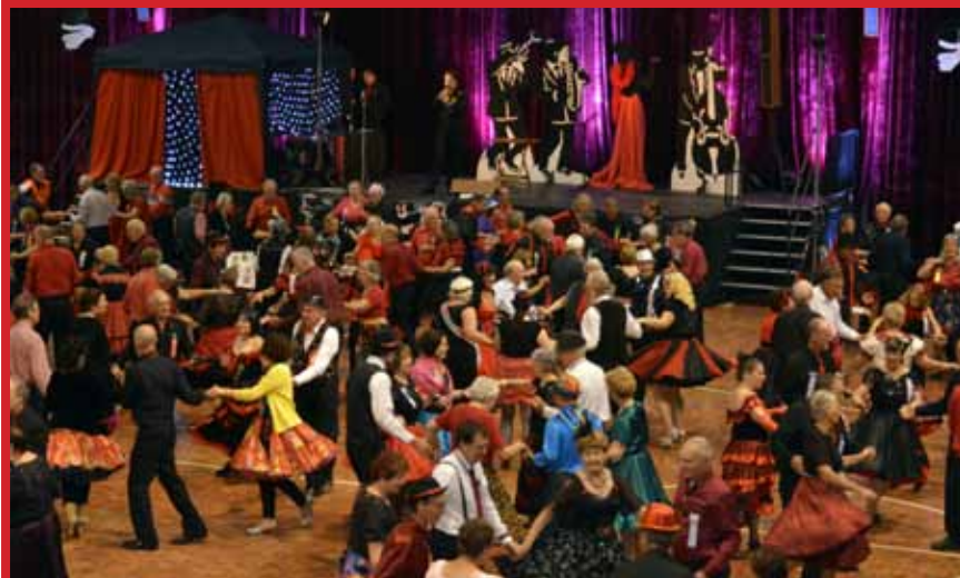
Below: National Convention Adelaide 2015